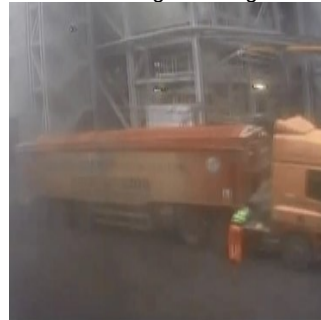
Driver runs alongside vehicle