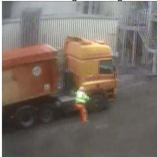
Driver jumps away from vehicle