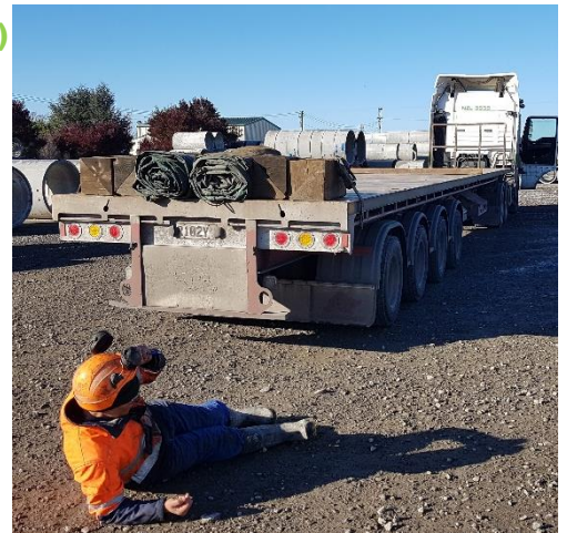
Location where driver was lying after he fell (re-enactment)