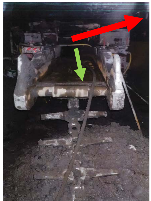
Figure 1 The red arrow shows the trajectory of the broken flight bar. The green arrow shows the pull direction of the 22 millimetre rope pulling the conveyor chain around the sprocket underneath the head of the miner.

One side of the flight bar failed and was ejected from the tensioned sling towards the worker who was standing near the rib bolter controls on the right hand side of the continuous miner.