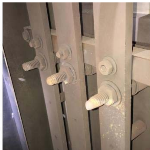
Left, Arc flash damage to the rear compartment of switchboard. Right, Protruding fuse-holder bolts in busbars.