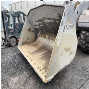
Before - Bucket showing razor sharp edge