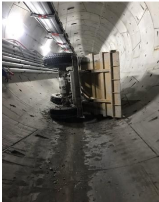
Figure 1: Rear View

What immediate actions were taken? (include initial prognosis) Dump truck was assessed and photographed in situ. A forklift was used to right the dump truck to prevent fuel spillage. The dump truck was then driven steadily out of the tunnel to the mechanical workshop for further inspection. The incident was reported to the Project Manager at 7.30AM. The operator was stood down from operating the dump truck until the investigation is completed.