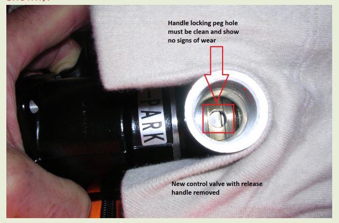
Locking peg hole

The areas that require a close inspection if you are looking to repair this valve are in the illustrations below (new valve shown).