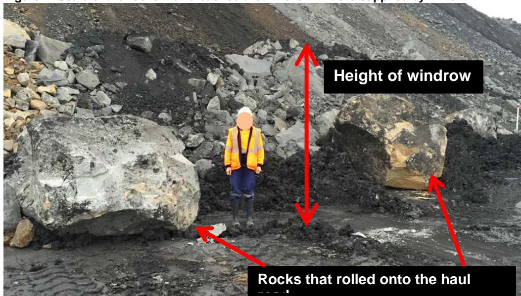
Figure 1: Scale of the rocks that breached the windrow.

There have been several incidents recently involving rocks breaching bunding at the base of dumps, impacting other work areas. The purpose of this safety bulletin is to highlight the hazard and make recommendations for control measures to minimise the potential for re-occurrence.