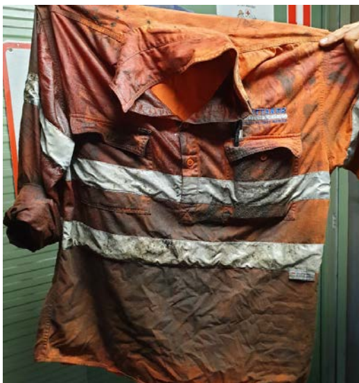
Figure 1: Shirt damaged by high pressure fluid release