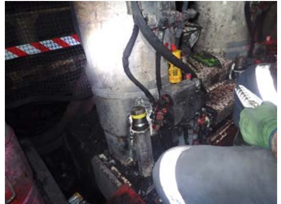
Figure 7: The failed hydraulic hose on the recovery power pack