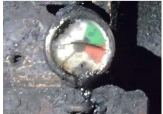
Figure 3: A pressure gauge on the longwall face

The pressure gauge was later tested as operational; however, the cover was cracked. A face audit identified that three out of 680 pressure gauges on the longwall face were also incorrectly indicating zero pressure.