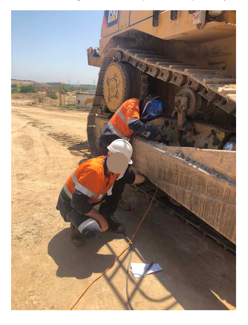
Figure 2: Re-enactment of assistant suffering an electric shock. (IncNot0033402).

A fitter had washed down a dozer in a sand mine and was preparing to weld. Another worker saw the fitter positioned awkwardly so went to assist. After getting a welding glove, he held a pipe in place. The worker felt a tingle up his arm when the fitter struck the arc.