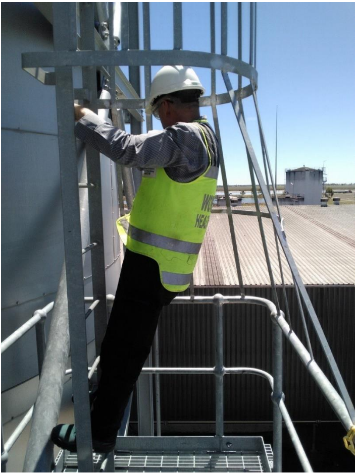
Photograph 2. The bottom of this vertical caged ladder has been flared out and extended down to the top guardrail.

Work tasks that do not allow a worker to maintain three points of contact at all times while ascending or descending the ladder should be avoided. Workers climbing ladders should never carry tools or equipment in their hand.