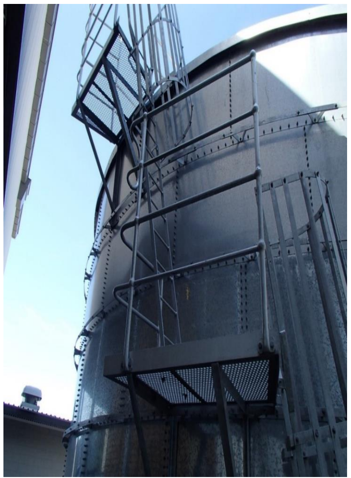
Photograph 1. Inclined caged ladder with additional rails installed to extend the height of the existing top guardrail.

The likelihood someone falling from the caged ladder and over the guardrail can be reduced by minimising the unguarded area between the cage and the top guardrail (distance 'A' in Diagram 1). Examples of control measures which would minimise the unguarded area between the cage and top guardrail are shown in Photographs 1 and 2.