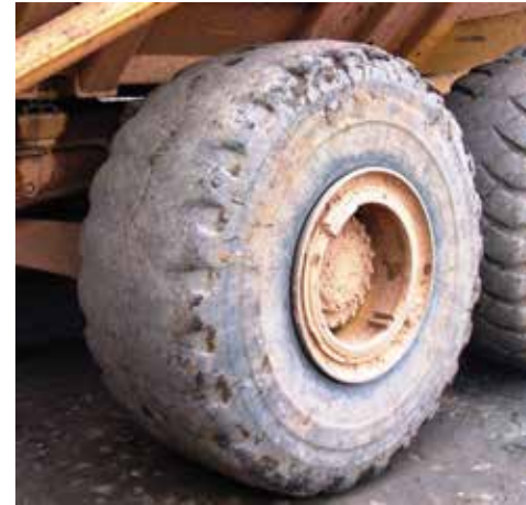
Tyre is worn and damaged and must be replaced immediately.

On all quarry vehicles tyre maintenance is critical and tyres should be checked daily by the driver for both wear and damage. If the tread on the tyre is sufficiently worn or damage is detected then the tyre must be replaced.