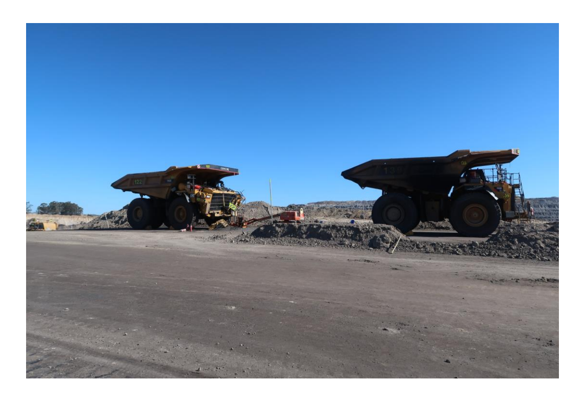
Figure 1: Final resting position of DT122 and DT139

The photograph below shows the final resting position of the two trucks after the collision.