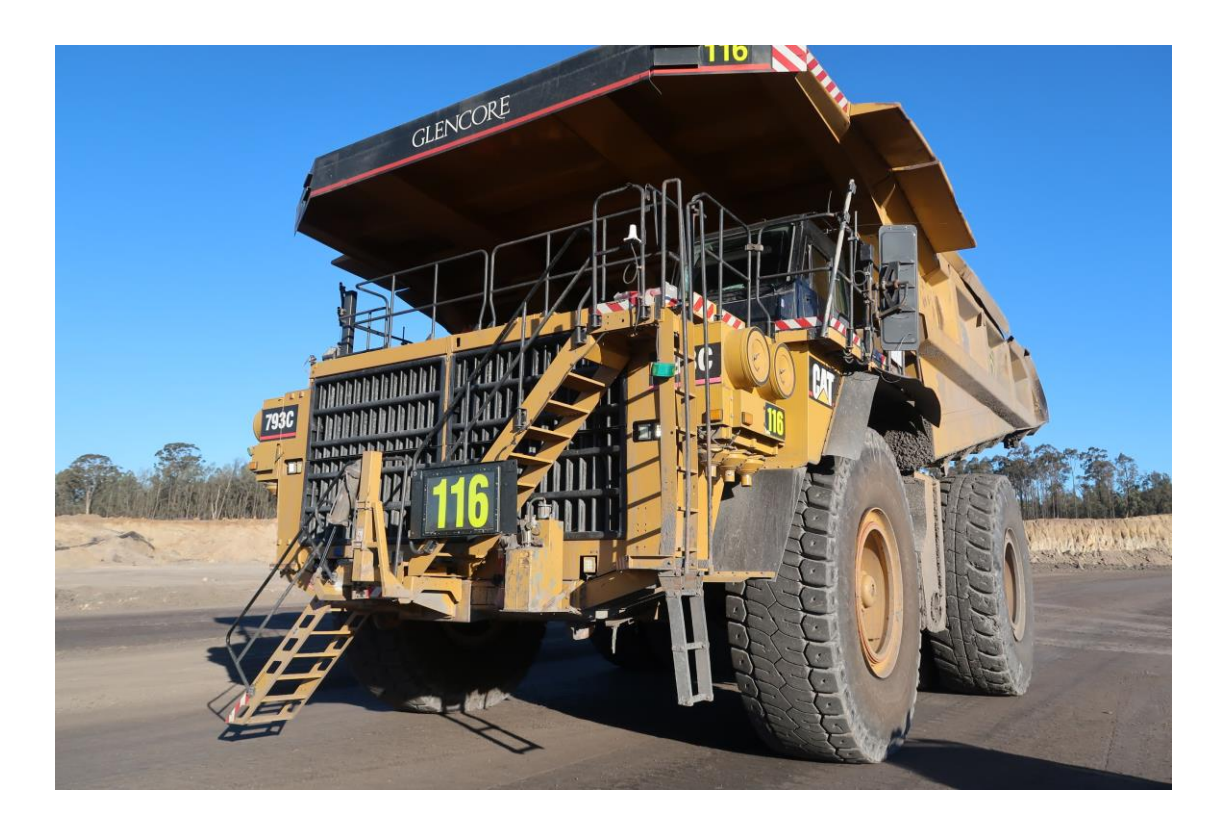
Figure 2: CAT793C dump truck

The photograph below is of a similar dump truck. The vehicle below was also being used at Bulga Open Cut.