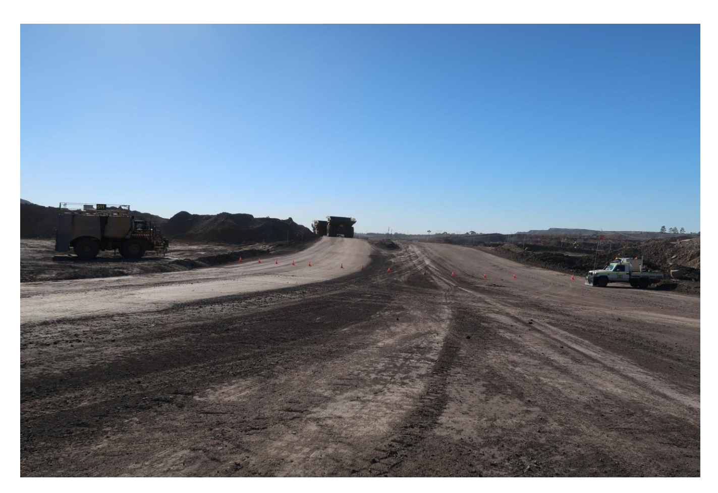
Figure 1: Roadway where collision occurred

The incident occurred on a main haul road, known as Swan Lake Road. The surface roadway is of hard, compacted clay. The grade of the roadway at the point of impact was +3.5% with a cross grade of 2.0%. The photograph below is of the roadway leading to where the collision took place. The two dump trucks involved in the incident can be seen in the centre of the photograph.