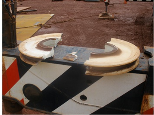
Damage to nylon head sheave. Right. Half of the failed sheave for the auxiliary hook remained in place. Left. Sheave sections recovered after the incident.