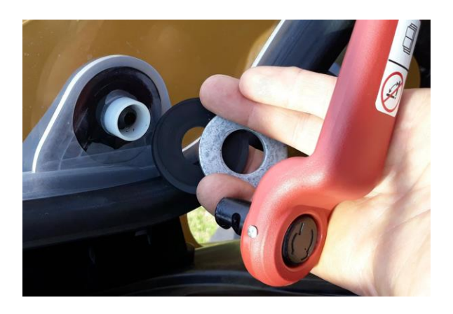
Figure 5 - This image shows the correct relationship of the inner components of the lower handle assembly. Note the rubber washer is next to the window and the steel washer is next to the handle. The lower handle components are assembled in the same order as that shown in Figure 3 for the upper handle.