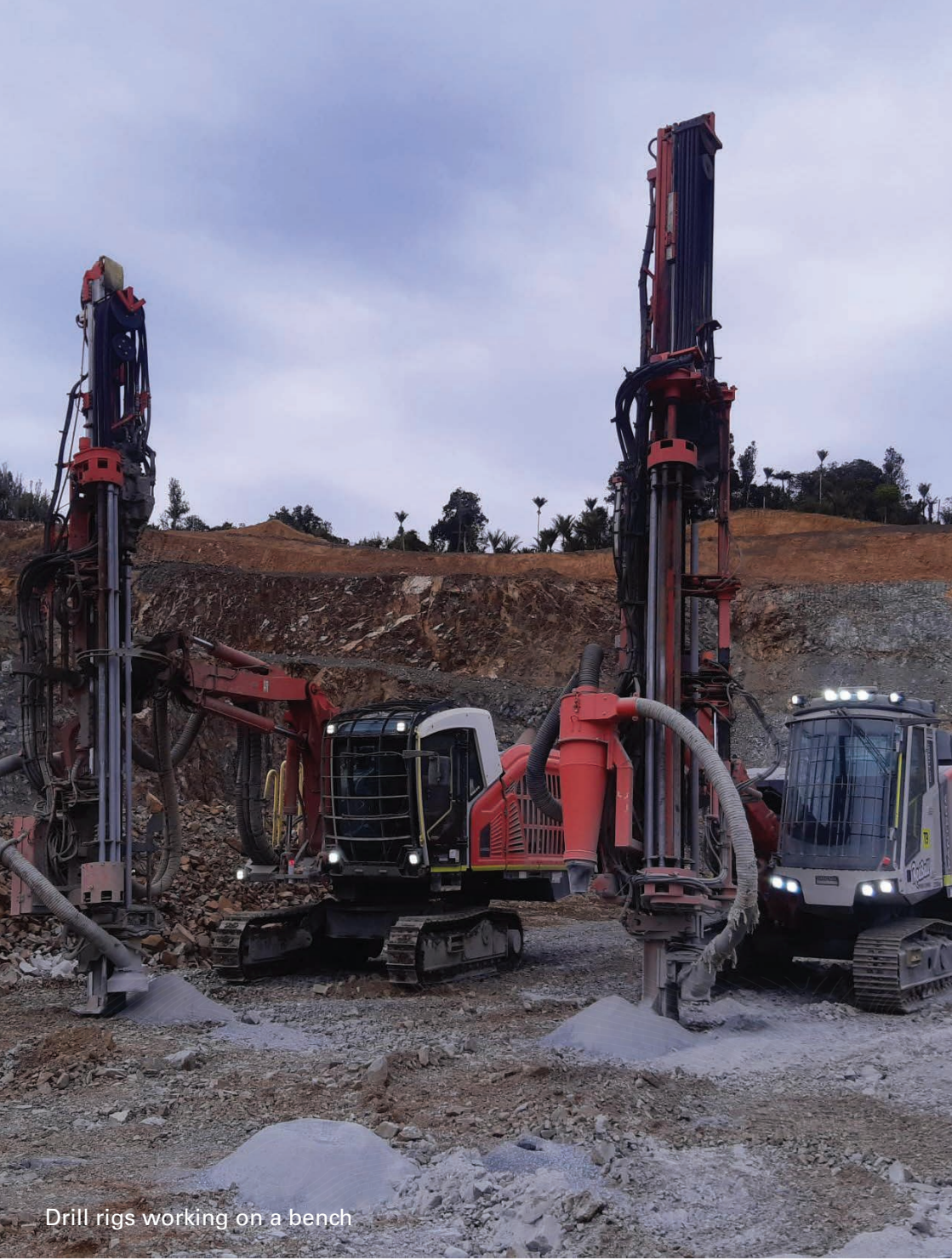
Drill rigs working on a bench