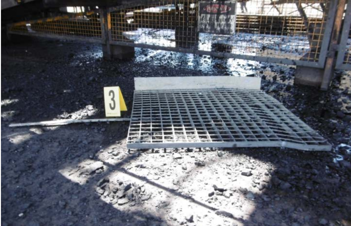
Figure 2: The fallen grid plate.

The three other men retreated from the area and reported the incident. The area was immediately fenced off.