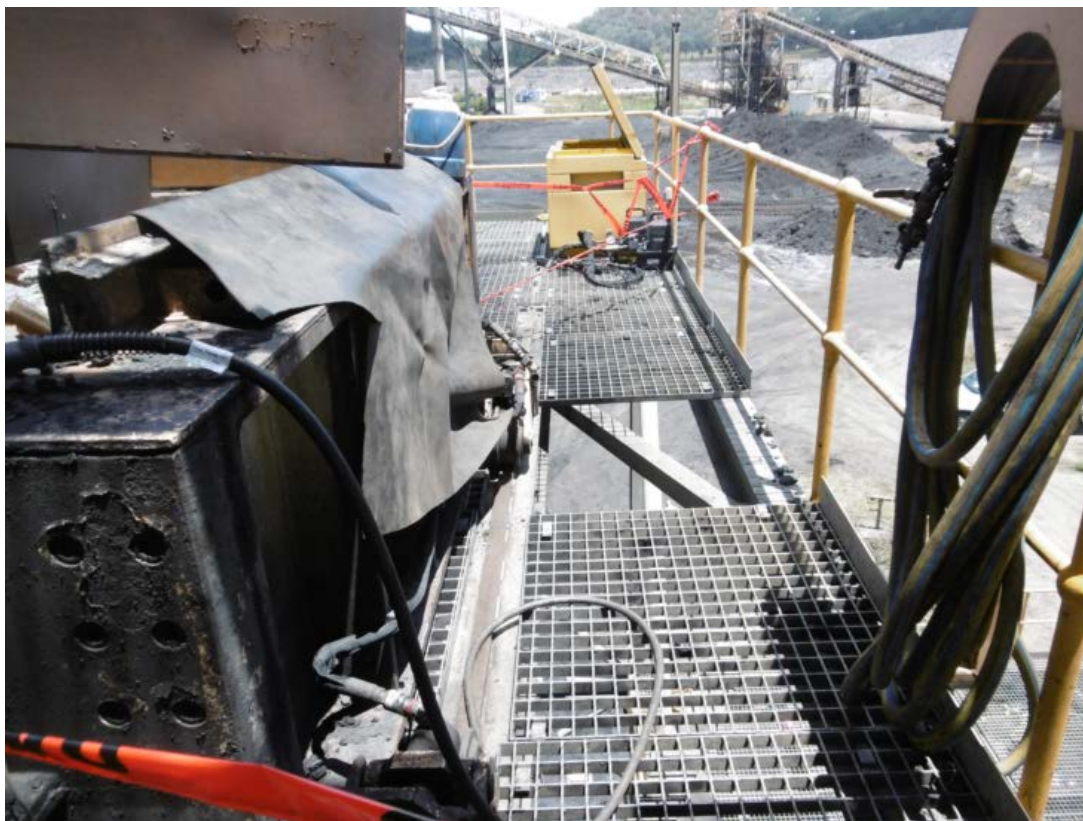
Figure 1: Walkway showing the missing grid plate.

The incident occurred at a mine near Mudgee on 22 December 2016.