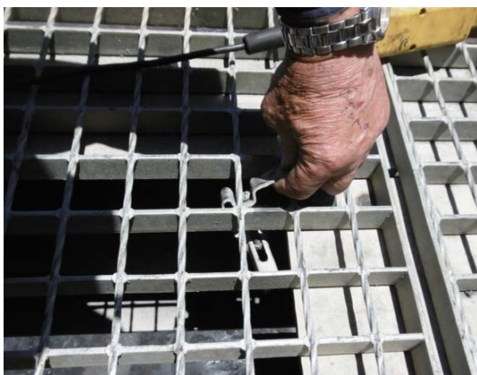
Figure 4 (left): loose holding clamp. Figure 5 (right): the walkway.

While investigating the various platforms in the area, the inspector found that many of the holding clamps that secured the floor plates were loose and some were missing.