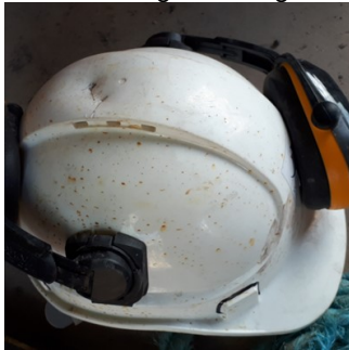
Hard hat with dent along back near centre