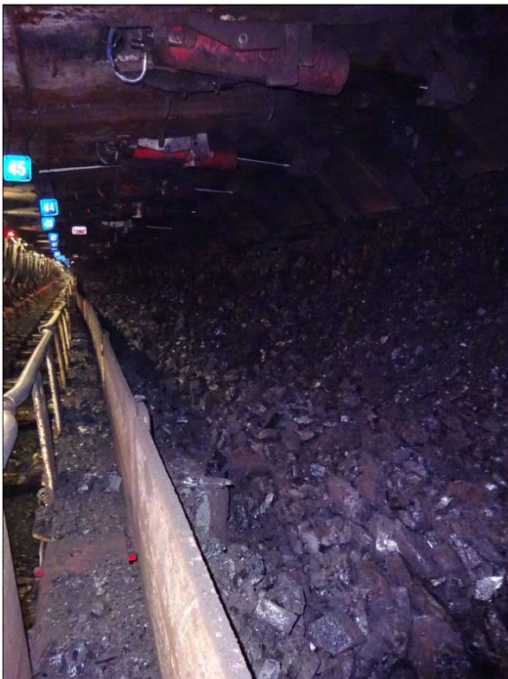
Figure 1: Broken coal on the face side of spill trays following the reported coal burst. i